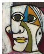
Picasso Self portraits using Primary colours