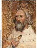
Edward the confessor