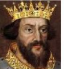
William the conqueror