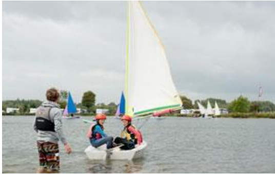
12 acre lake